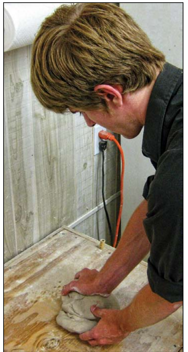
Rolling out a 10-pound brick of “wedged clay.”